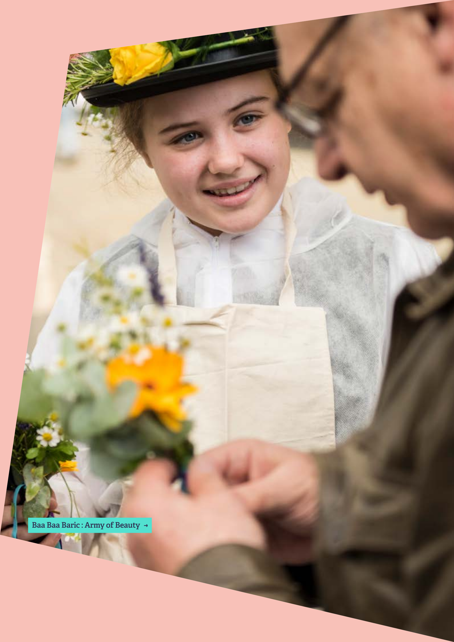
Baa Baa Baric : Army of Beauty →