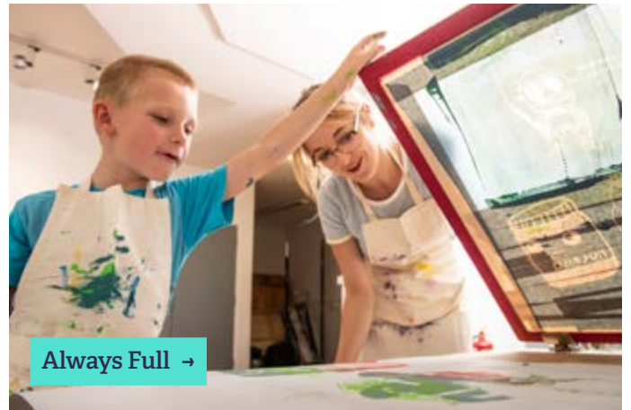
Always Full →