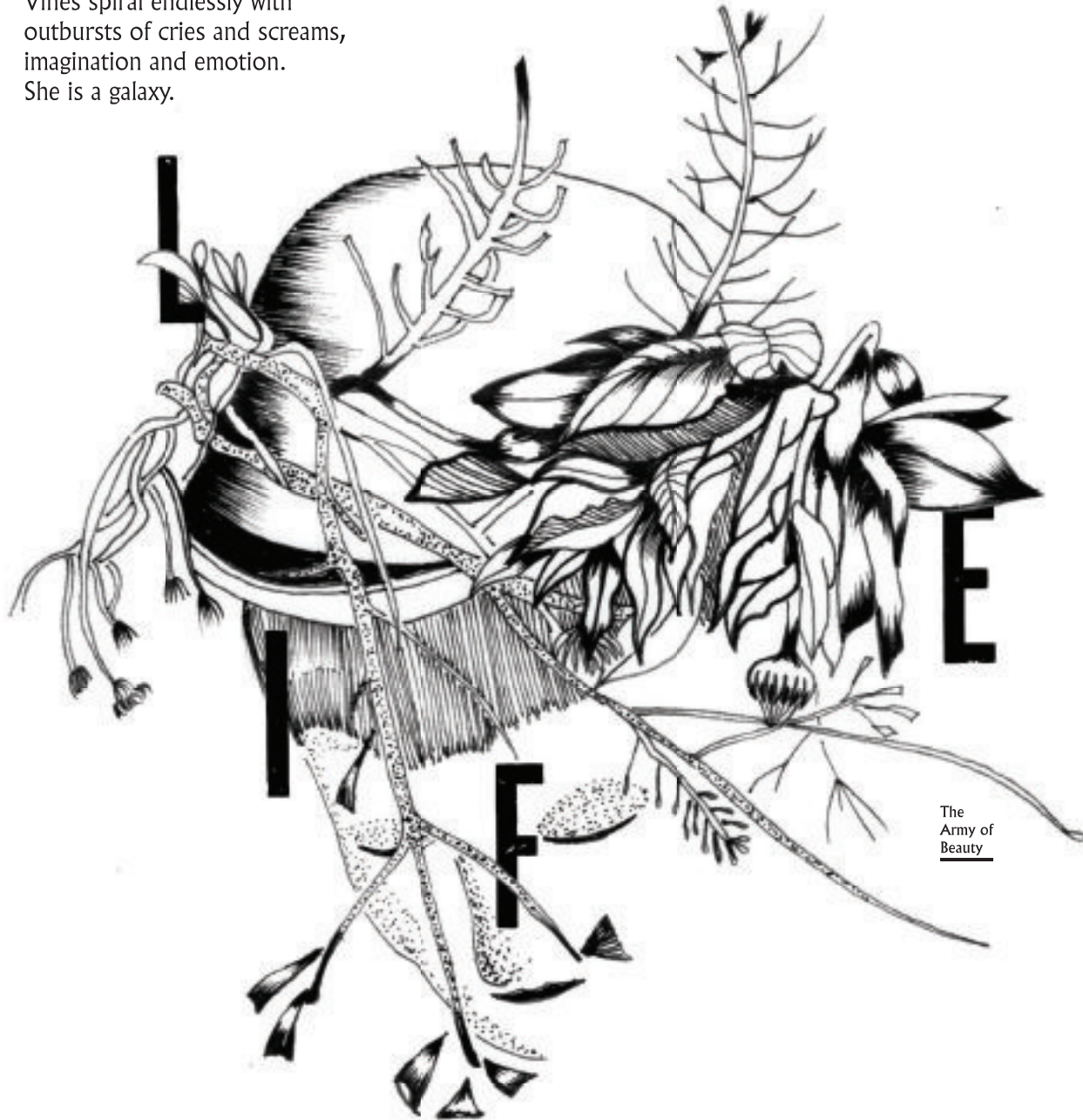
The Army of Beauty

H er heart creates life. Vines spiral endlessly with outbursts of cries and screams, imagination and emotion. She is a galaxy.