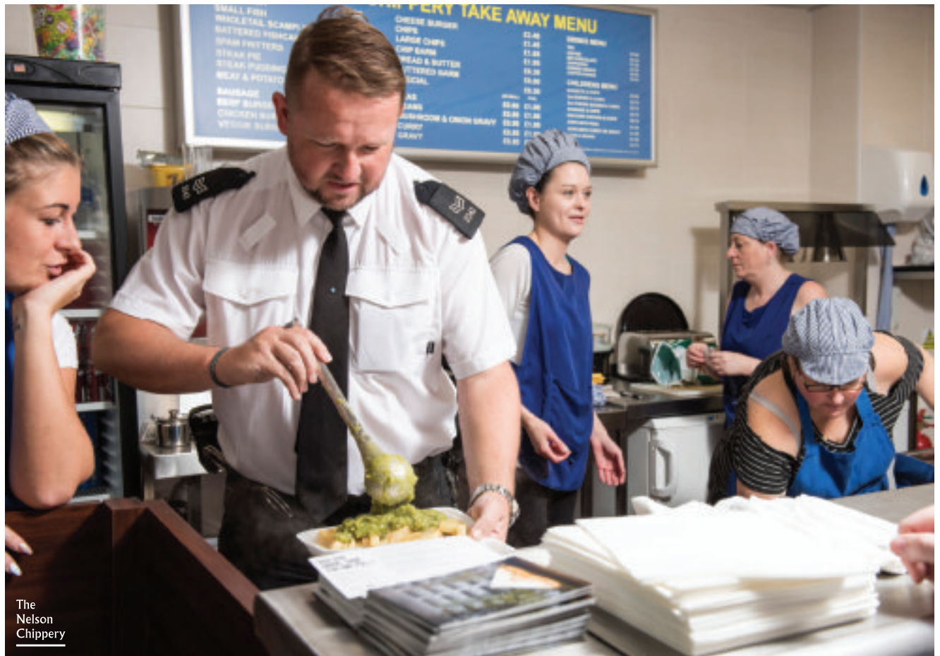
The Nelson Chippy

The community come together to work for change. 26.3% of children in St Helens are living in poverty (St Helens Joint Strategy Needs Assessment, 2015)