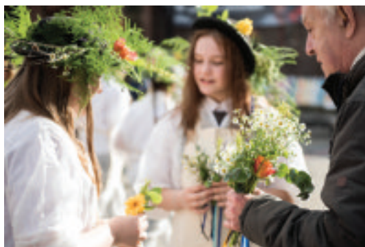
From Inside The Shed Children Speak

The Army of Beauty tender a posy to the citizens of St Helens.